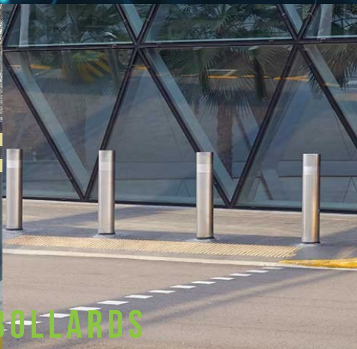
FIXED & REMOVABLE BOLLARDS