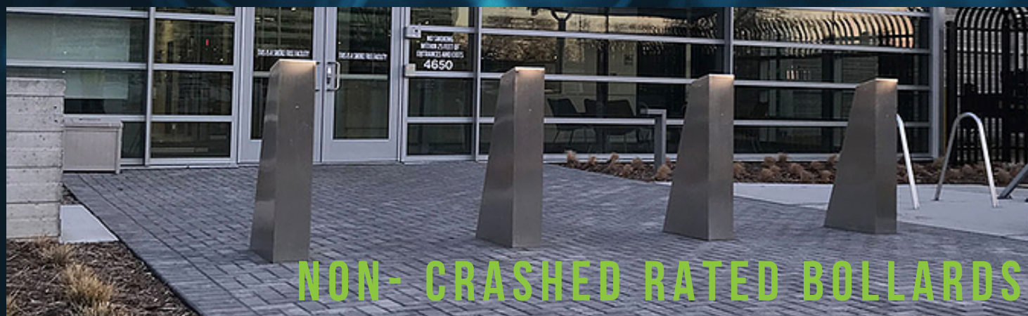
NON-CRASHED RATED BOLLARDS