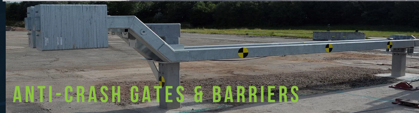
ANTI-CRASH GATES & BARRIERS